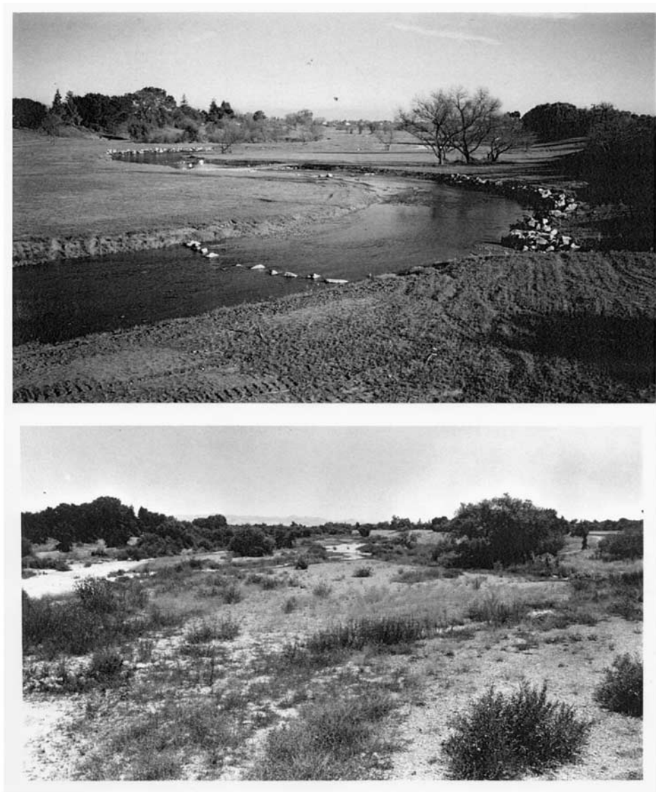
Figure 2. Photographs looking downstream along the channel of Uvas Creek in coastal California. (a) In January 1996, approximately 2 months after construction of a channel reconstruction project that emplaced a meandering channel form, and (b) in June 1997, after the project was destroyed during storm flows with a return period of 5–6 years. Historical geomorphological analysis indicated that the channel reach had been braided historically, typical of streams draining the Franciscan Formation in the California Coast Ranges, with episodic flows and high sand and gravel transport.

nels and floodplains [ Junk et al. , 1989; Bayley , 1991; Molles et al. , 1998]; patterns of downstream continuity or discontinuity in physical and biological parameters [ Vannote et al. , 1980; Fischer et al. , 1998; Poole , 2002; Benda et al. , 2004]; and vertical connections between the channel and underlying hyporheic zone [ Ward , 1989; Stanford and Ward , 1993].