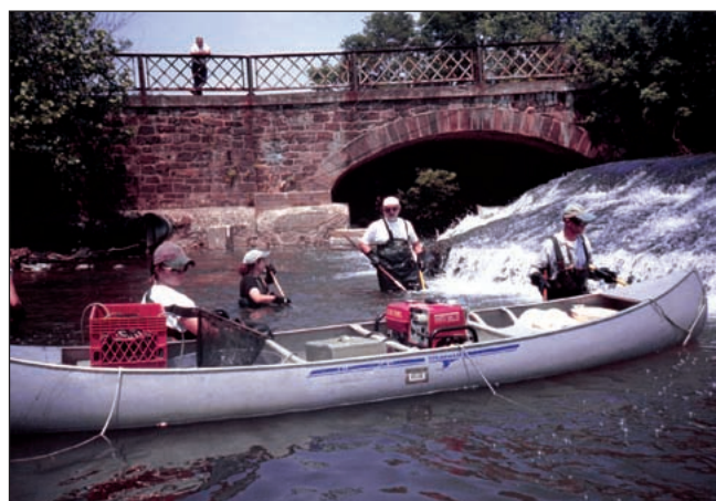
Figure 5. The effectiveness of dam removal as a method of river restoration is being evaluated in several regions of the US. (left) Scientists from Philadelphia's Patrick Center for Environmental Research study the removal of the 2-m high milldam on Manatawny Creek in southeast Pennsylvania in Aug 2002, (right) after documenting ecological conditions before the dam was removed (Bushaw-Newton et al. 2002).