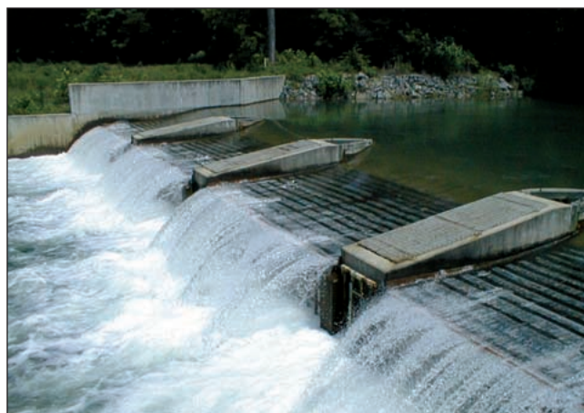
Figure 2. Improvements in Tennessee Valley Authority dam operations include (left) surface water pumps in the Douglas Reservoir (French Broad River, NC), designed to push oxygenated water from the surface to deepwater turbines, and (right) infuser weirs downstream of Chatuge Dam (Hiawassee River, NC), designed to provide both minimum flow and dissolved oxygen.