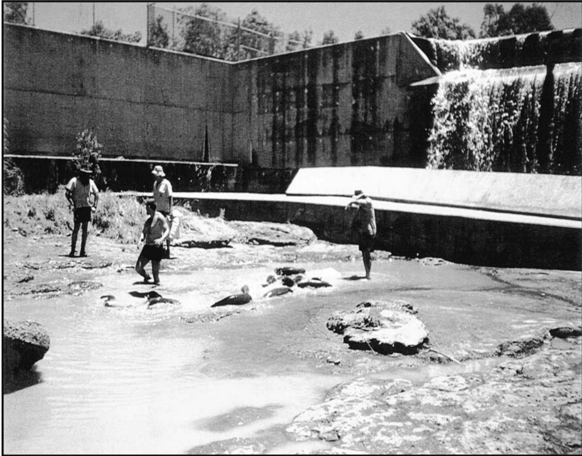
PLATE 1. An example of loss of ecological goods provided by rivers: fish stranded below weir by rapid fall in water level.

dependent upon the timing and pattern of stream discharge, as well as serve as an “umbrella” flow target to protect species and processes as yet unstudied; (5) the method is intended for application to classes of streams that represent the substantial variation in climatic, physiographic, and ecological conditions prevailing at regional or national scales, and can therefore produce regional environmental flow guidelines.